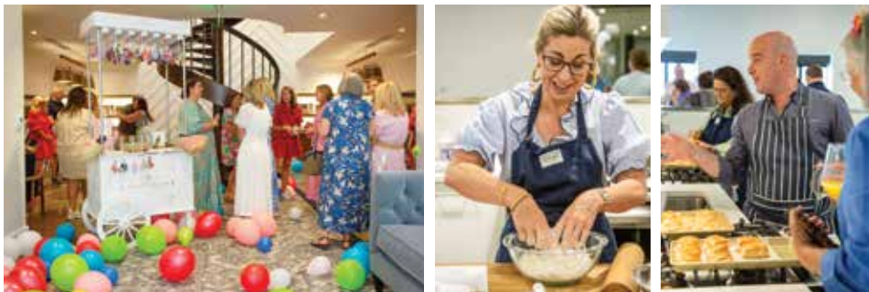
Events, Test Kitchen Partnerships, Recipe Development