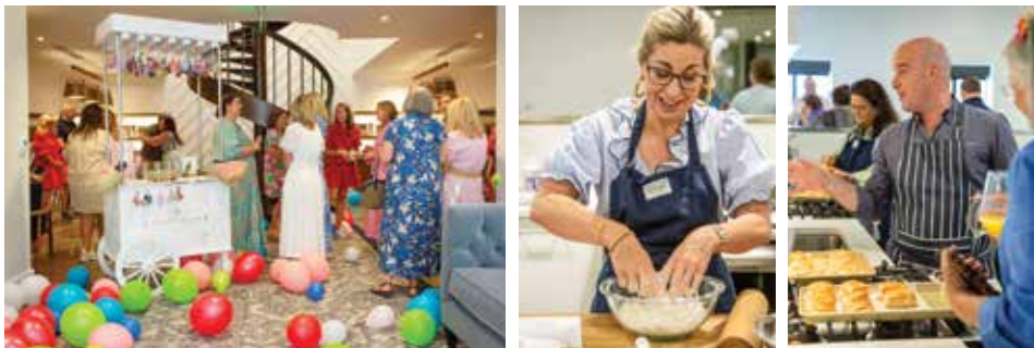
Events, Test Kitchen Partnerships, Recipe Development