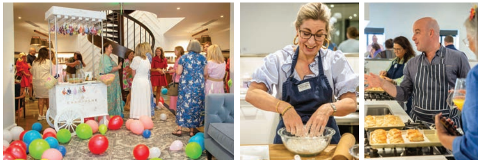
Events, Test Kitchen Partnerships, Recipe Development